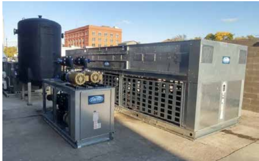
Recent installation of a Drake brewery chiller system.

Most chillers have two levels of capacity; full on and full off. If your chiller can't modulate the capacity, the chiller will start and stop frequently. This short cycling will lead to short compressor life. Drake brewery chillers have a number of available capacity controls protecting you from short cycling.