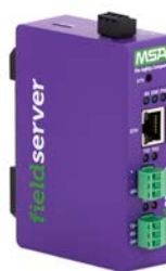
FieldServer BACnet Router

Given the popularity of BACnet in building automation, integrators should take advantage of FieldServer's leading portfolio of BACnet gateways and routers. While FieldServer BACnet gateways can convert virtually any device into a BACnet device, FieldServer BACnet routers are used to integrate BACnet MS/TP devices into a BACnet/IP backbone—a far more efficient approach than burning up expensive ports on a BACnet controller.