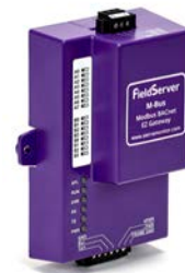
FieldServer EZ Gateway M-Bus Modbus BACnet