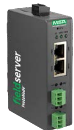
FieldServer QuickServer Gateway